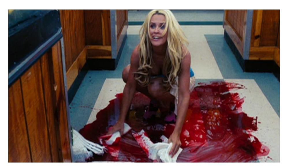
Fig. 2: The unforgettable supermarket scene in Dirty Love

make a trip to the supermarket. As she hovers in the personal hygiene aisle, frantically scanning the shelves for a box of affordable tampons, she realizes she is unable to buy any of them. Much to her dismay the only kind in her price range are elephantine maximum absorbency pads. Just as she sighs in frustration, she begins to leak blood all over the floor. Panicked, she grabs the pads and races to the washroom. Finding it occupied, she runs towards the checkout only to spot her ex, Richard, nearby. To avoid him, she sprints across the supermarket all the while gasping and making a myriad of comical grimaces. In a perversion of the proverbial banana peel gag, an elderly woman creeping along the meat aisle accidentally slips on Rebecca's bloody trail. She drops her grocery basket and falls on her back, crying "Help! I've fallen..." She tries to sit up, only to notice the blood on the arm of her blue cardigan, "...and I'm bleeding. Oh no!" While this moment is played up for ultimate slapstick effect, Rebecca's menstrual mire is quickly turned into dangerous territory in more ways than one.